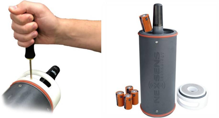
Figure 4: Installation of (16) D-Cell batteries.