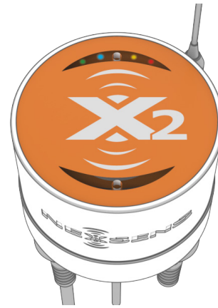
Figure 3: X2 LED light indicators.