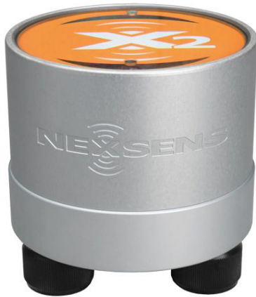
Figure 1: X2 Environmental Data Logger

IMPORTANT - BEFORE FIELD DEPLOYMENT: Completely configure new X2 systems with sensors and a web connection in a nearby work area. Operate the system for several hours and ensure correct sensor readings. Use this test run to become familiar with the features and functions.