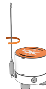
Figure 2: Step 6 - Antenna connection.