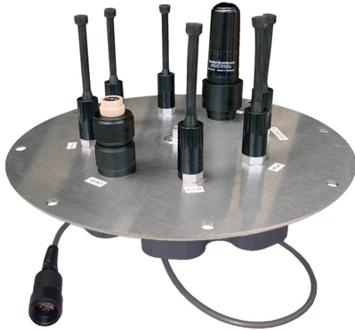
Figure 1: X2-CBMC Buoy-Mounted Data Logger

IMPORTANT - BEFORE FIELD DEPLOYMENT: Completely configure new X2 systems with sensors and a web connection in a nearby work area. Operate the system for several hours and ensure correct sensor readings. Use this test run to become familiar with the features and functions.