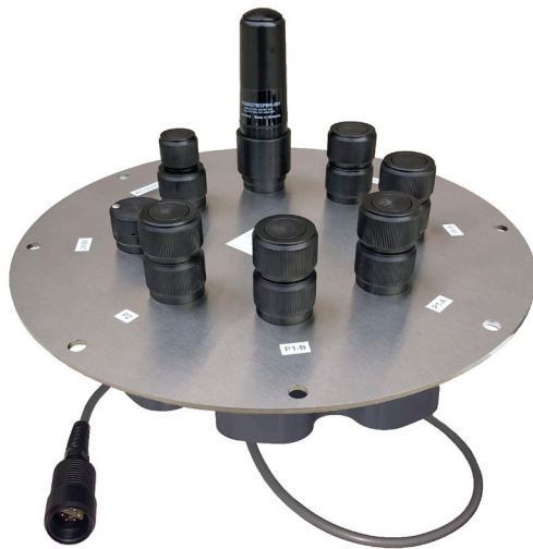
Figure 1: X2-CB Buoy-Mounted Data Logger

IMPORTANT - BEFORE FIELD DEPLOYMENT: Completely configure new X2 systems with sensors and a web connection in a nearby work area. Operate the system for several hours and ensure correct sensor readings. Use this test run to become familiar with the features and functions.