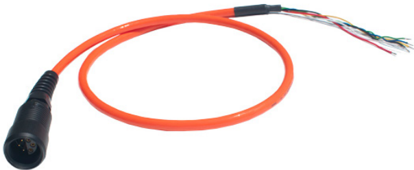
Figure 1: UW6-FLxR Cable Assembly