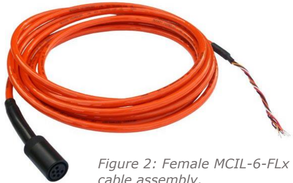
Figure 2: Female MCIL-6-FLx cable assembly.