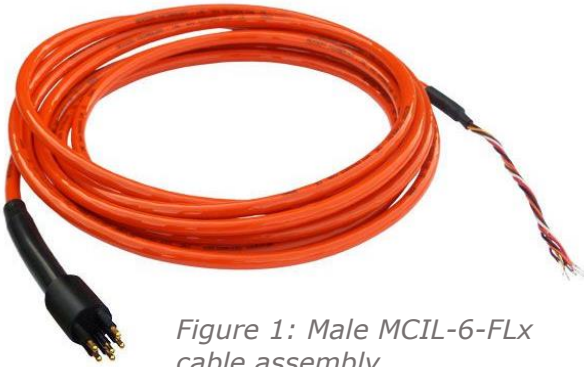
Figure 1: Male MCIL-6-FLx cable assembly.

Wet mateable cable assemblies with locking sleeves are available for interfacing with a variety of water quality instruments.