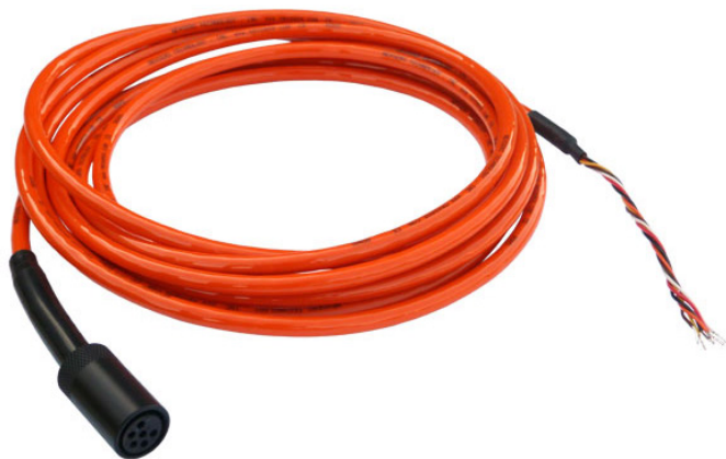
Figure 1: NexSens Cable Assemblies.