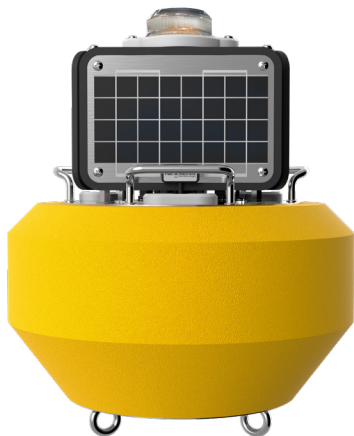
Figure 1: NexSens CB-25 Data Buoy