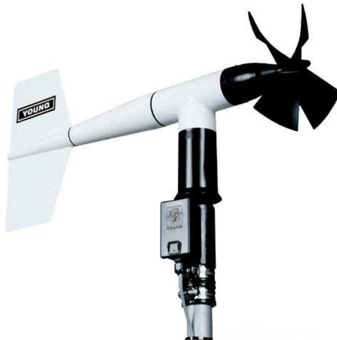
Figure 1: RM Young 05103V wind monitor

The wind direction sensor is a low aspect ratio vane, ensuring good fidelity in fluctuating wind conditions. Vane angle is sensed by a built-in potentiometer housed in a sealed chamber. With a known excitation voltage applied to the potentiometer, the output voltage is directly proportional to vane angle.