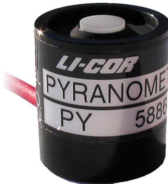
Figure 1: LI-COR LI-200 solar radiation sensor

The LI-200 uses an analog current output to communicate and is cosine corrected for plane surface radiation measurements. The instrument is widely used in agricultural, meteorological, and solar energy studies.