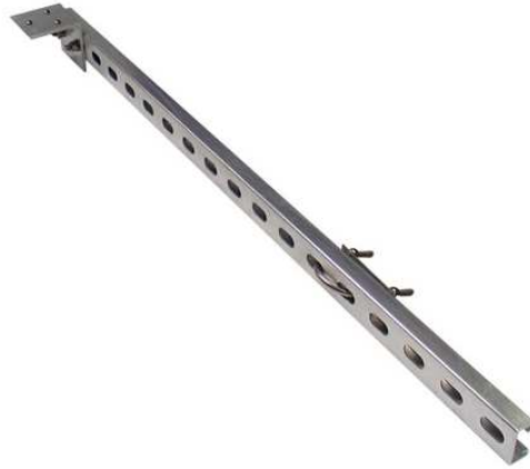
Figure 2: NexSens M-ARM mounting arm for LI-COR terrestrial light sensors

LI-COR 2003S mounting and leveling fixture is recommended to ensure proper mounting for all LI-COR terrestrial light sensors. The NexSens M-ARM mounting arm can be used with the fixture. It consists of a 3' section of aluminum unistrut, a stainless steel bracket designed specifically to accommodate LI-COR 2003S mounting and leveling fixtures, and a u-bolt for quick attachment to any pole less than 2 3/8" in diameter.