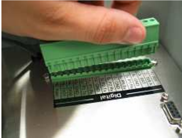
Figure 3: Unplug the green terminal strip from the data logger before wiring the sensor