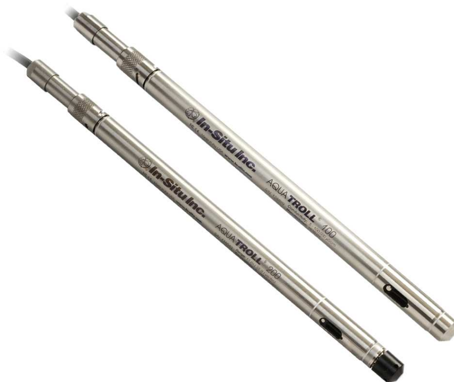
Figure 1: In-Situ Aqua TROLL 100 (Right) and Aqua TROLL 200 (Left)

The Aqua TROLL 200 dynamically compensates level readings for changes in water density due to changes in salinity.