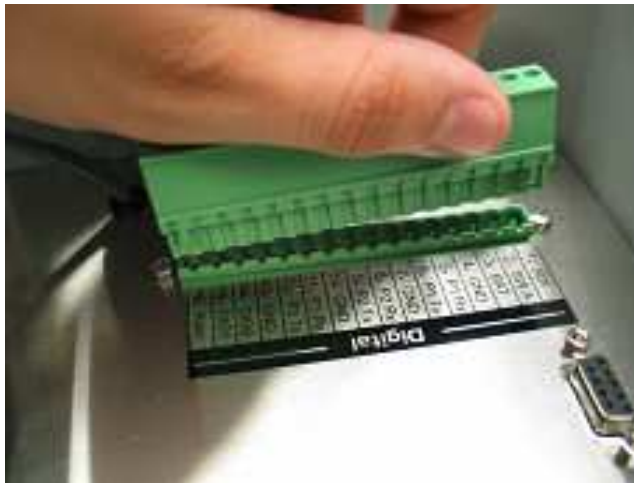
Figure 2: Unplug the green terminal strip from the data logger before wiring the sensor

An In-Situ twist-lock to flying lead adapter cable is required for wiring Aqua TROLL instruments directly to the iSIC data logger.