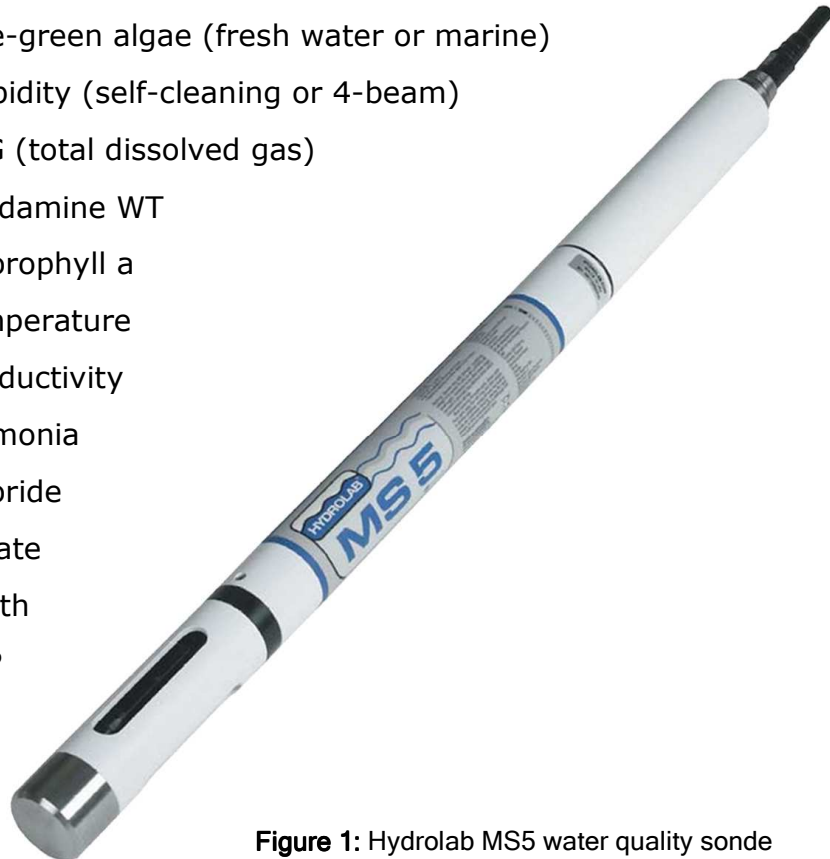
Figure 1: Hydrolab MS5 water quality sonde