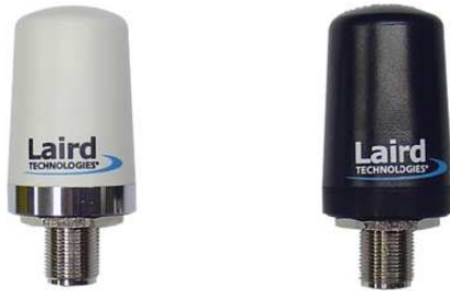
Figure 1: NexSens A44 radio (white antenna, pictured on left) and A49 cellular (black antenna, pictured on right) high gain antennas

NexSens cellular and radio high gain antennas are ideal for remote data logging applications. The low profile and rugged designs allow for long term deployments in harsh environments.